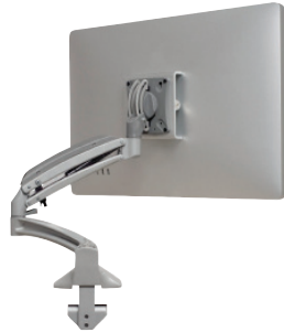
Single Monitor KID120_XRH