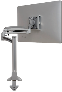
Single Monitor KIC120_XRH