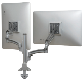
Dual Monitor KIC220_XRH