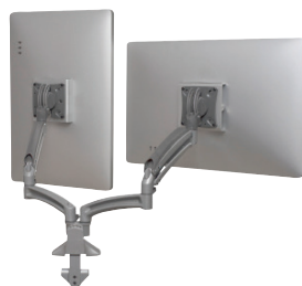
Dual Monitor KID220_XRH