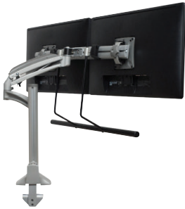
Dual Monitor Array KIC22H_XRH