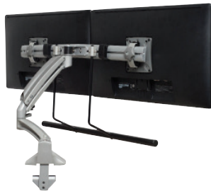
Dual Monitor Array KID22H_XRH