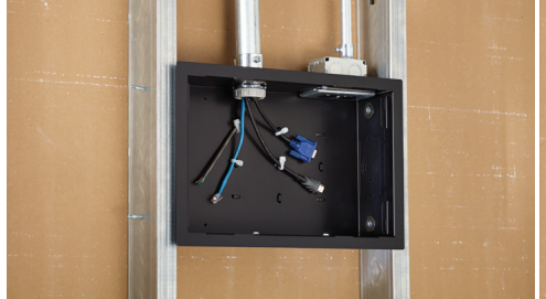
PAC525F 9 x 14.25" In-Wall Box w/ Flange