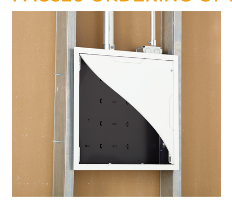
Dimensions 14.25 x 14.25 x 3.9" (362 x 362 x 99 mm)