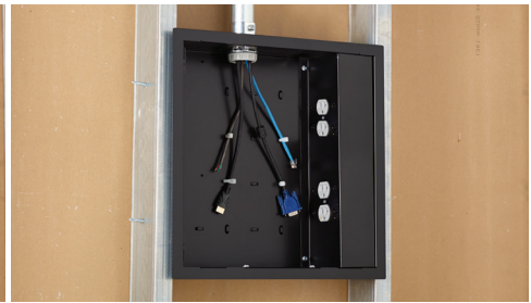
PAC526FP4 14.25 x 14.25" In-Wall Box w/ Flange & 4 Power Receptacles