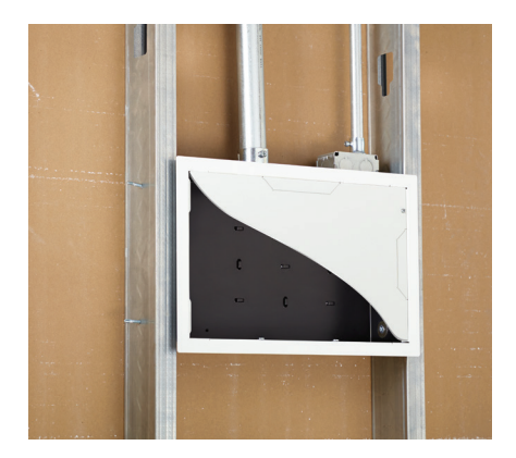
Dimensions 9 x 14.25 x 3.9" (229 x 362 x 99 mm)