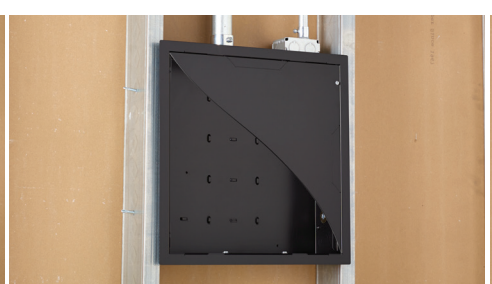
PAC526FC 14.25 x 14.25" In-Wall Box w/ Flange & Cover