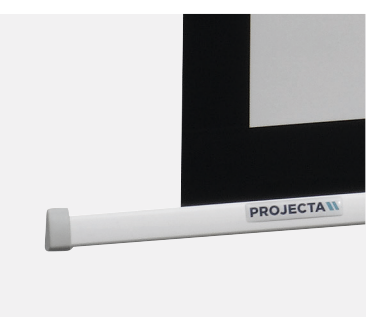
Triangular slat bar retracts into the case