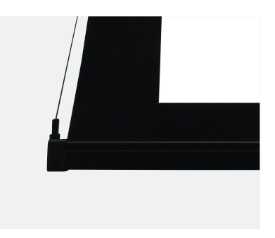
Slat bar retracts into the case