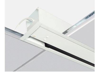
Perfect integration into the ceiling