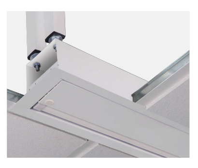
Perfect integration into the ceiling