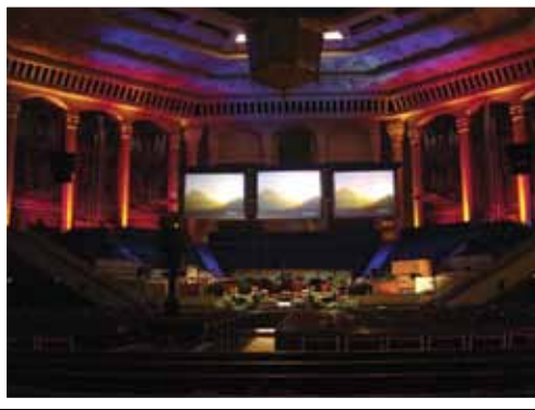
Second Baptist Church Fowler, Inc