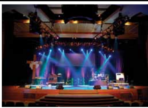
Rolling Hills Delta AV

There are no more challenging projection environments than worship facilities. Many churches and houses of worship were built before anyone imagined the integration of audio and video utilized in today's services. Therefore, there are more facilities that need a Da-Lite custom projection screen solution in the worship market than in any other.