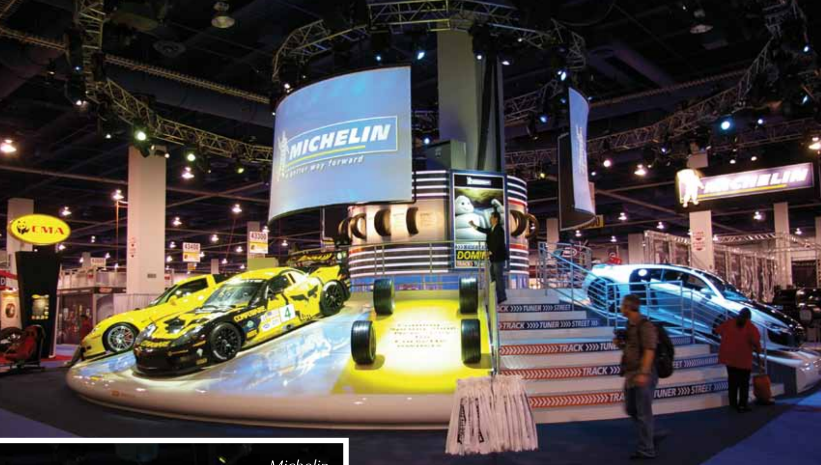
Michelin Mid-Co AV