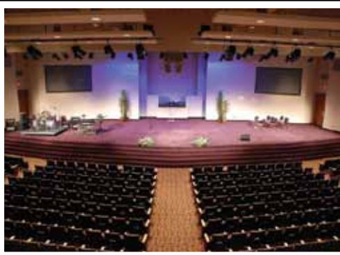
Greater Grace Conference Technologies