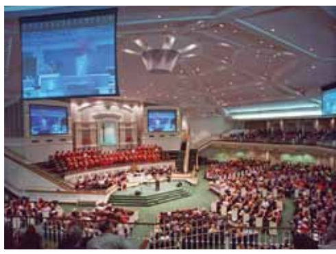
Southern Hills Baptist Church Fowler, Inc