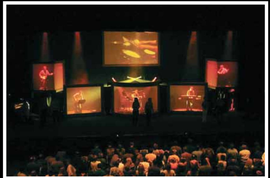
Fellowship Church Fowler, Inc

No one is more adept at meeting these challenges than the Da-Lite Design Center.